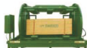
Pass Thru Turner

Within the conveyor line, each panel can be uniformly or selectively turned for grading purposes. Sweed Panel Turners feature nonabrasive arms that gently overturn the panels without damaging delicate veneer or laminate.